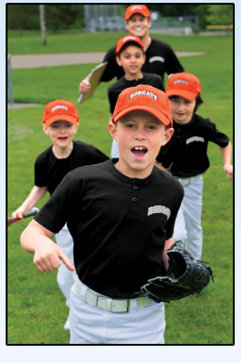
Port Authority ® - Youth Pro Mesh Cap. YC833

Breathable and comfortable, this cap has a great pro look, complete with a contrasting grey underbill